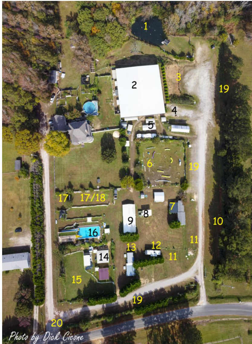
Teamworks Youngsville Location